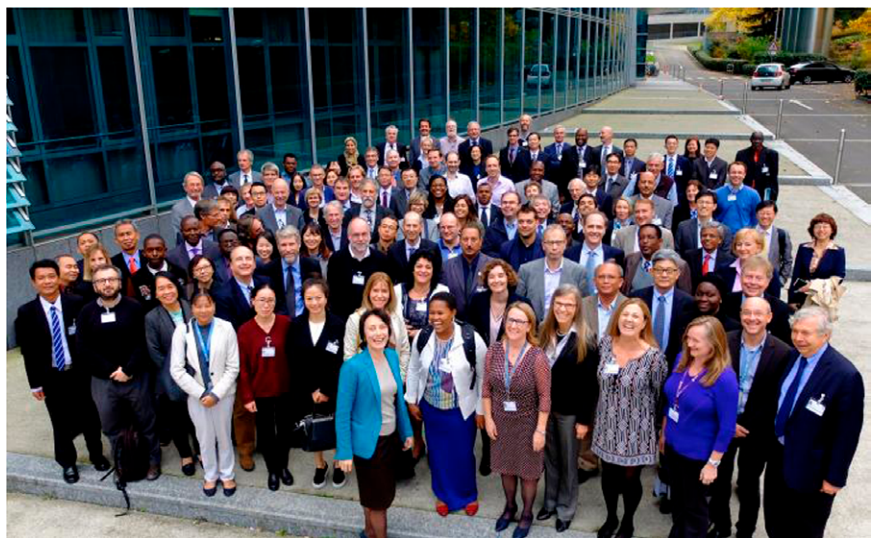
Fig. 1. Participants of the Science Summit, held 20–22 Oct 2017 at the World Meteorological Organization's headquarters in Geneva, Switzerland. A full list of participants is provided in the online supplement.

With a focus on establishing the organization's future